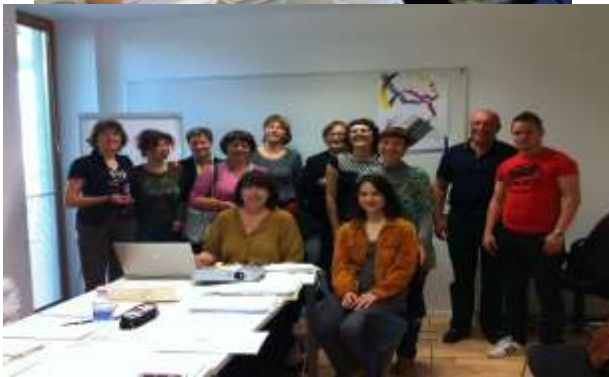
ECIL pilots in UK & Slovenia